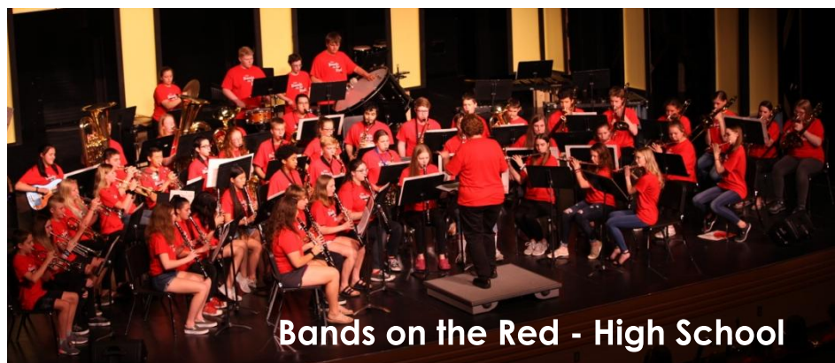
Bands on the Red - High School

Just a quick glimpse of our summer so far! Other programs not shown on this page are our Pre-K SPA program for students aged 3-5 and our MySPA program, which is designed for students of all ages with special needs. Both of these programs begin in July.