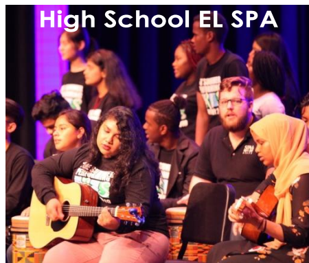
High School EL SPA