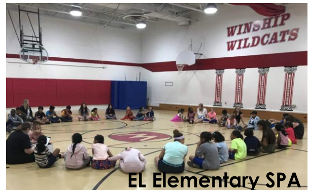
EL Elementary SPA