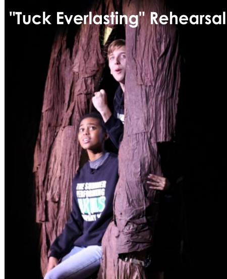
"Tuck Everlasting" Rehearsal