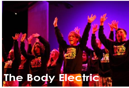
The Body Electric