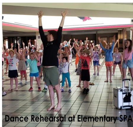
Dance Rehearsal at Elementary SPA