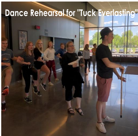
Dance Rehearsal for "Tuck Everlasting"