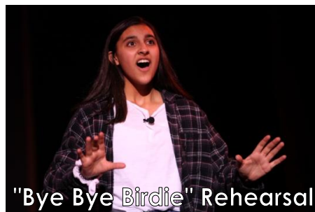
"Bye Bye Birdie" Rehearsal