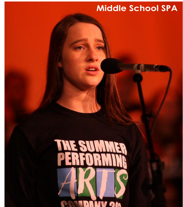
Middle School SPA